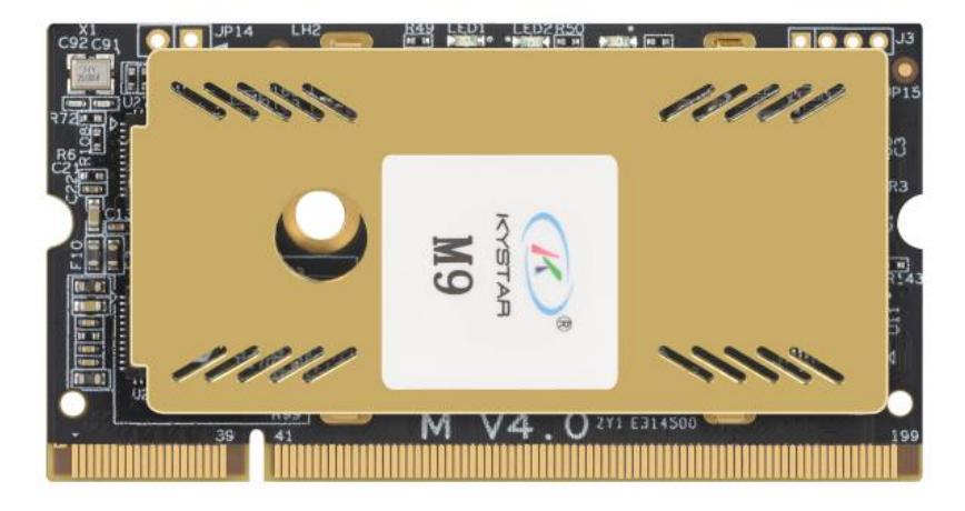
Figure 1 Front view of the M9 receiving card